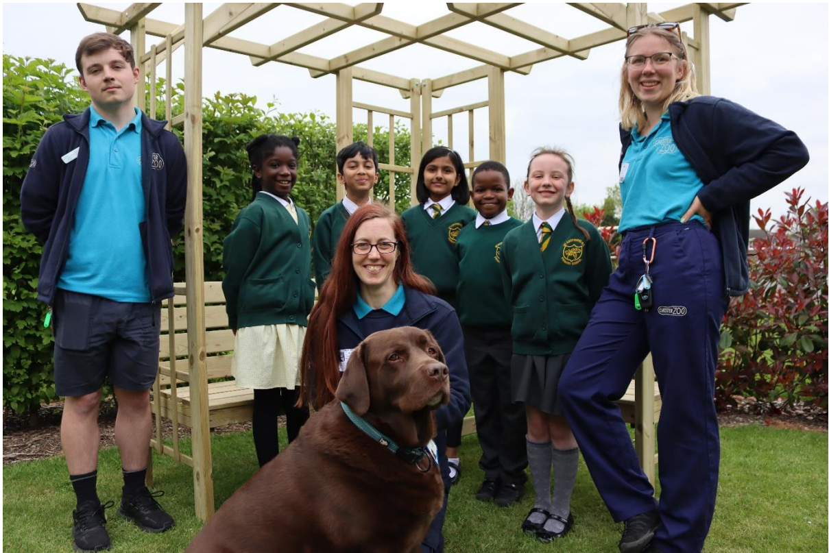
Chester joins the children in welcoming the Rangers from Chester Zoo