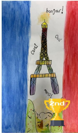
Bonjour Paris 7