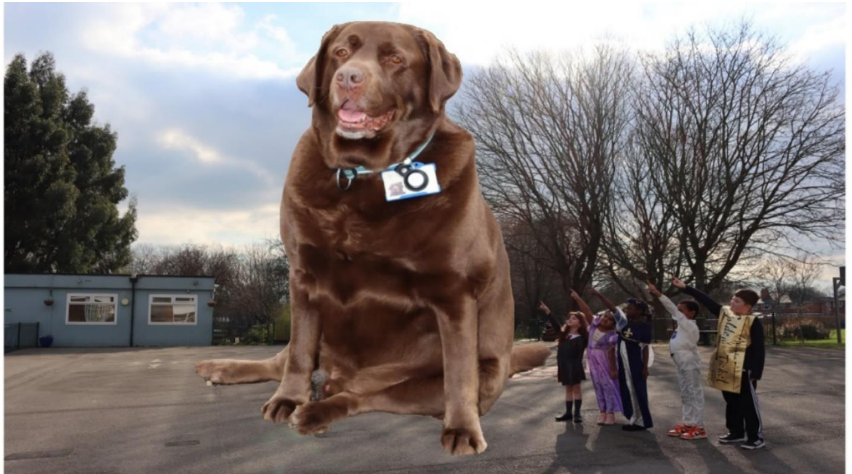
Chester, the Big Brown Dog